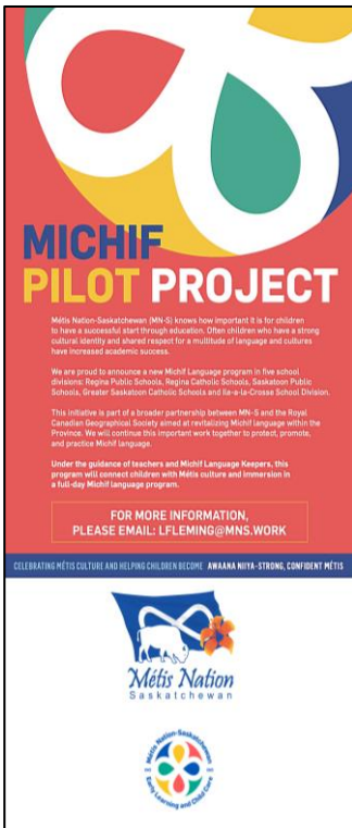
Project Poster located on: https://metisnation.sk.ca/2020/06/23/mn-s-teams-with-5-school-boards-for-michif-early-learning-pilot-project/

GDI encourages everyone to visit the Métis Museum website online at http://www.metismuseum.ca/ and check out all the Michif resources we have available! The GDI Michif to go app can also be downloaded to smartphones from the Apple and Google Play store 📱