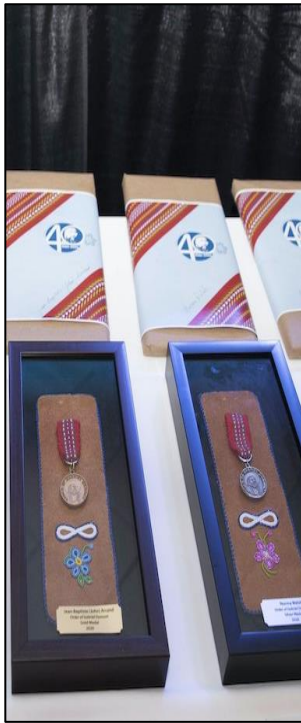
Gold & Silver Order of Gabriel Dumont Awards

In July 2020, the GDI Board of Governors passed a motion to accept nominations for the Order of Gabriel Dumont medals on an annual basis. Offering this prestigious award annually has the potential to raise the positive profile of the Institute, recognize important and influential community members, and create a critical mass of recipients and supporters of the Institute. The medals will be awarded annually in all three categories, Gold, Silver, and Bronze. The Order of Gabriel Dumont Silver and Gold award recipients are selected by a Selection Committee appointed by the GDI Board of Governors. Anyone can nominate a person for an Order of Gabriel Dumont award. The Order of Gabriel Dumont Bronze student awards are nominated and